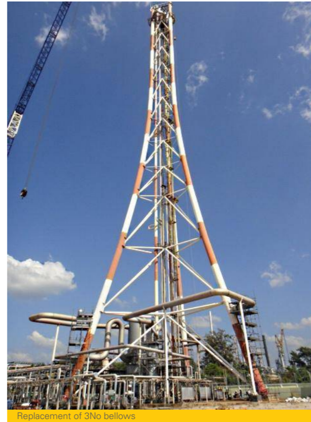
Replacement of 3No bellows