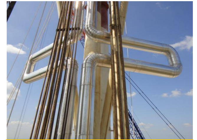
Insulation to 8 + 6 steam liner