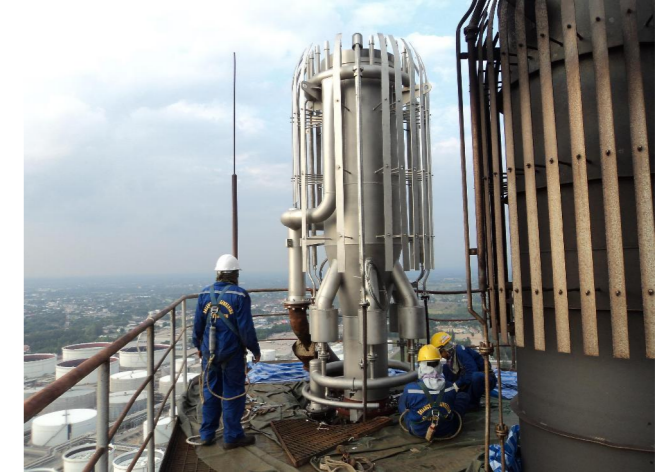
Installation of new pilot burner