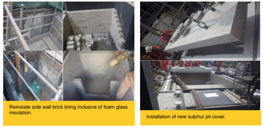
Reinstate side wall brick lining inclusive of foam glass insulation.