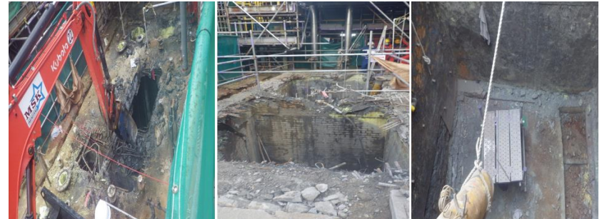
Removal of pit cover using mini excavator. Hacking and removing hardened sulphur. Complete removal of existing brick lining walls.