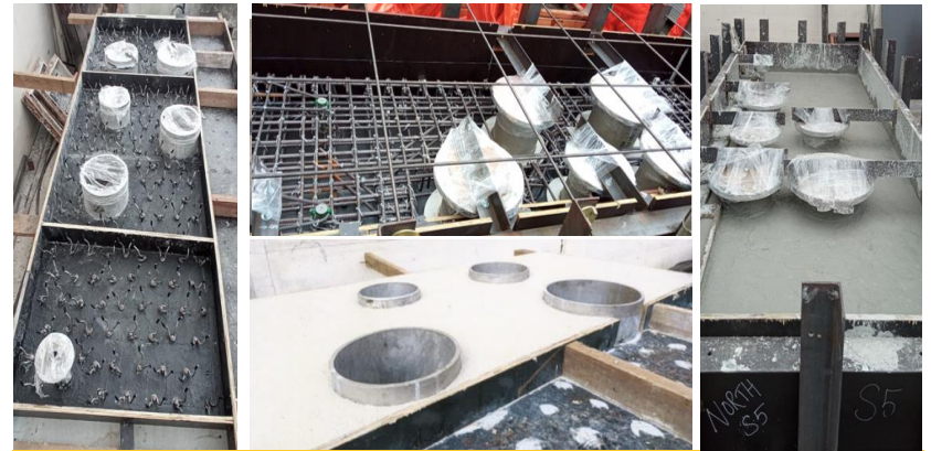
Off site fabrication work for the new sulphur pit cover.