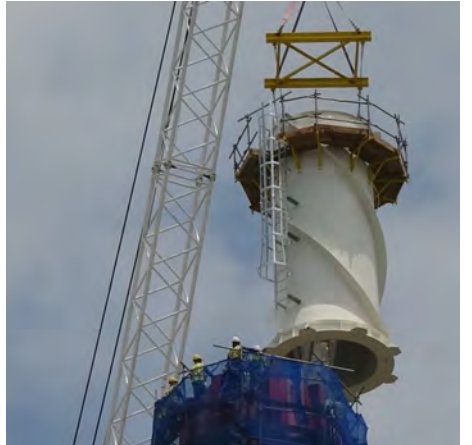
Lifting of bottom extension unit section