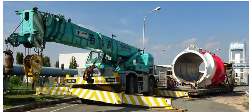
Chimney extension unit section delivered to site