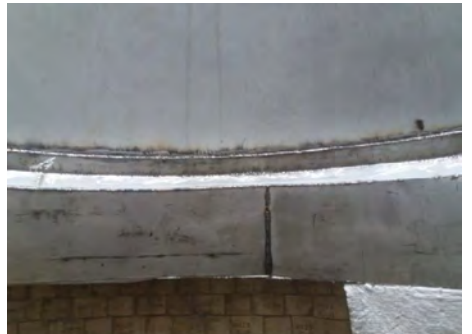
Installation of internal SS316L cladding plate