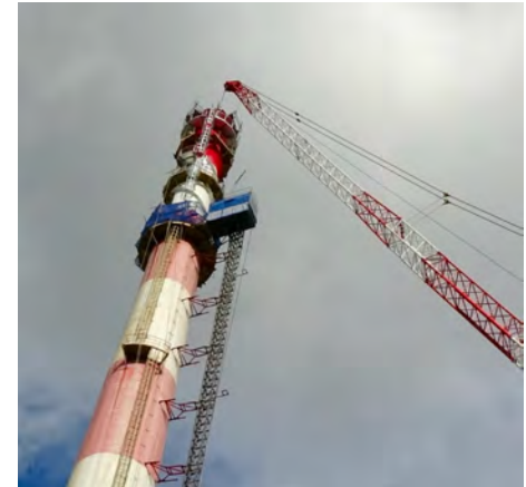
Lifting of middle extension unit section