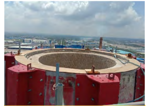
Installation of T section brackets on top chimney