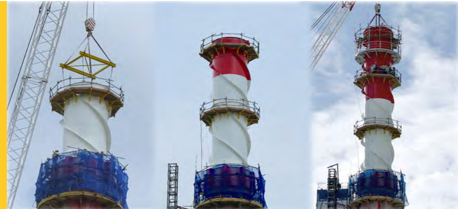
VGI3 Conversion Project (Chimney Extension) was part of the expansion plan of NSG Vietnam Glass Industries Ltd. BEC was the main contractor for this Project.

VGI3 CONVERSION PROJECT (CHIMEYN EXTENSION)