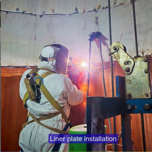
Liner plate installation